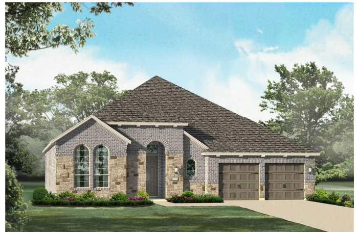
612 Copper Sage Drive in La Cima

4 Bedrooms | 3 1/2 Bathrooms | 3,051 sq ft