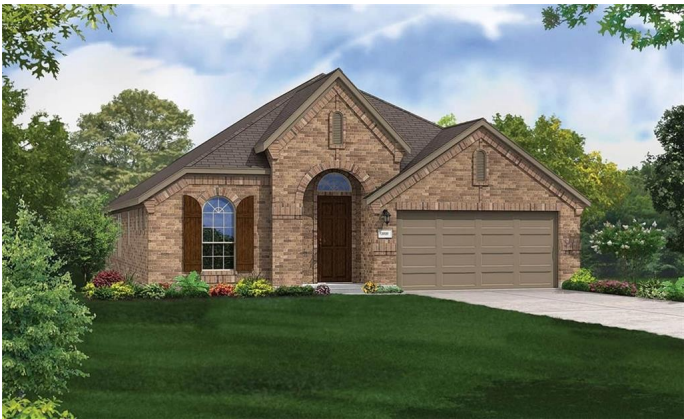
LAUREL | FLOOR PLAN

Due to supply chain issues, some options and selections may be substituted or revised. Must verify all options and details with builder representative. Laurel plan with features that include: Extended Covered Patio with Gas Drop | Pre Plumbed for Water Softener Loop | 42" Light Grey Cabinets with Hardware | Wood Patterned Vinyl Plank Floors | Stainless Steel Appliances | Single Bowl Stainless Steel Kitchen Sink | Granite Counters. Available March.