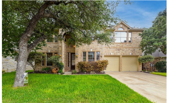
Select 2 story home with solar panels in Parkside, Avery Ranch

Follow the easy flow of this home's design to enjoy upgraded wrought iron balusters on the stairway to reach the second floor.