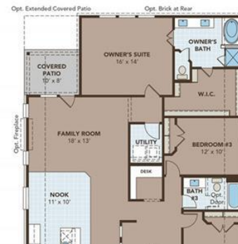
OLEANDER | FLOOR PLAN OPTIONS