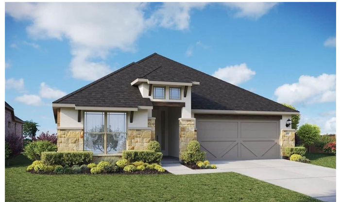
OLEANDER | FLOOR PLAN