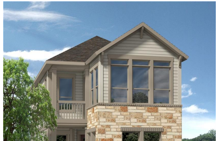
THE STEPHANI 13603 DEFANCE PASS