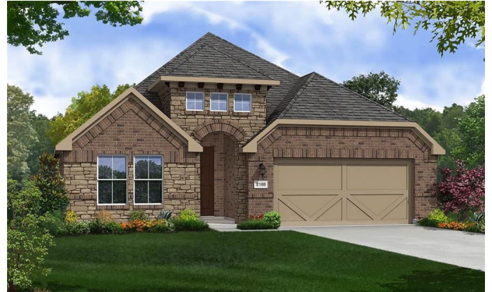
JUNIPER | FLOOR PLAN