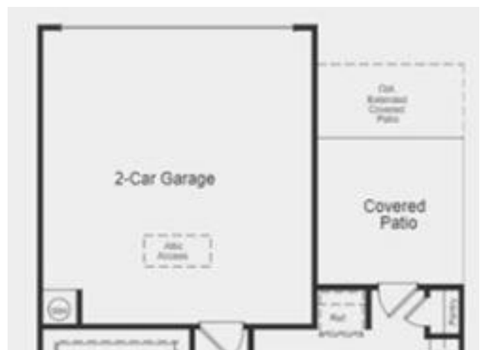
1a. Signature Collection