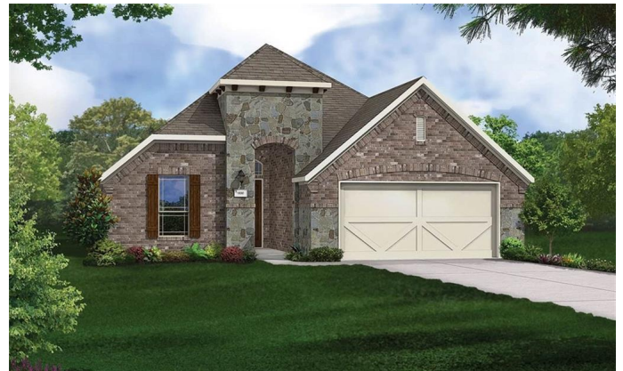
PALM | FLOOR PLAN