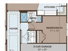
Opt. Bedroom #4 with Bath #3