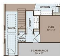
Opt. First Floor Stairs