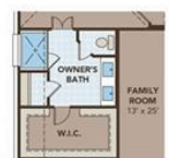
Opt. Enlarged Shower