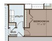
Opt. Bedroom #4