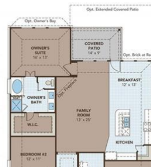
PALM | FLOOR PLAN OPTIONS