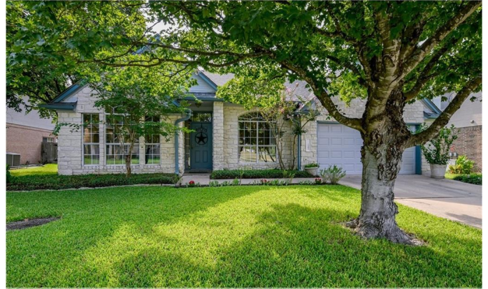
Welcome Home to 1207 Timber Bend Dr.

Don't miss this opportunity! Fabulous large, single story floorplan with so much flexibility. Great for multiple generations, roommates, and/or families with 3 wings each with privacy and separate full bathroom. The primary suite wing is expansive and private with 2 rooms plus the oversized bathroom and fabulous storage areas. The French doors allow abundant light and quick access to the back yard. The recently remodeled en-suite bath features an over-sized walk-in shower and soaker tub and leads to the bonus room (with closet) which has direct access from the garage – perfect for an office, exercise room, nursery, or 5th bedroom. The second wing includes 2 bedrooms plus another remodeled bath and can be closed off with a lovely barn door. The front wing includes a separate guest suite with private bath. The large central kitchen boasts a stone accent wall and center island with skylight plus plenty of counter and cabinet space. The front living area and formal dining welcome you with high ceilings into this lovely home. Custom double doors open to a expansive family room with fireplace. This room also opens to the lovely backyard oasis! Recent improvements include: roof and gutters, exterior paint and landscape refresh, 50 gallon hot water heater, flooring, some interior paint and remodeled or updated baths. Enjoy the close-in Pflugerville location. Convenient access to all major thoroughfares, numerous shopping, entertainment and recreational opportunities and