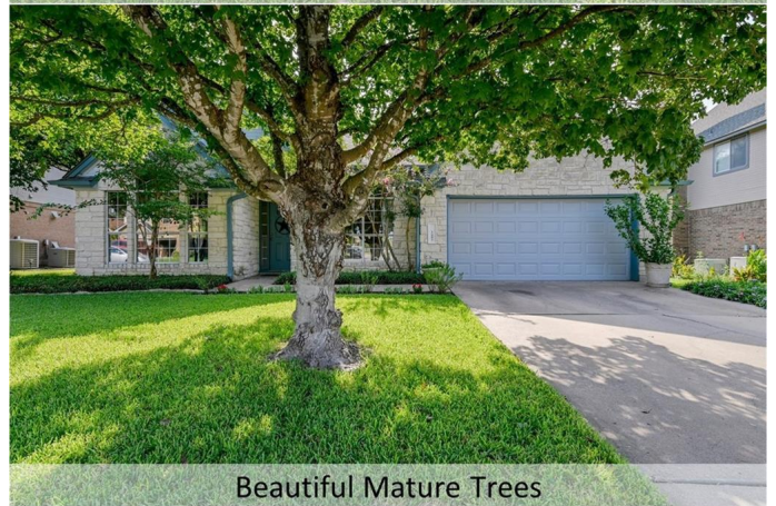
Beautiful Mature Trees