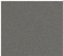
Kitchen Countertops: Grey Expo