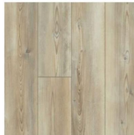
Wood Floor: #1005 Cut Pine