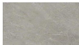
Master Bath, Bath 2 & 3 Wall Tile: Oasis 500 Light Grey, 12x24, Horizontal Offset Pattern