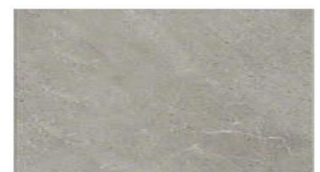
Utility, Master Bath, Bath 2 & 3 Floor Tile: Oasis 500 Light Grey, 12x24, Straight Pattern