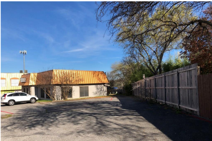
AT&T Yahoo Mail - Pic for great oaks for sale