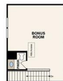
OPT. BONUS ROOM W/ POWDER BATH