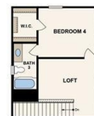
OPT. LOFT/BEDROOM 4 W/BATH 3