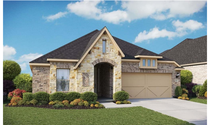
OLEANDER | FLOOR PLAN