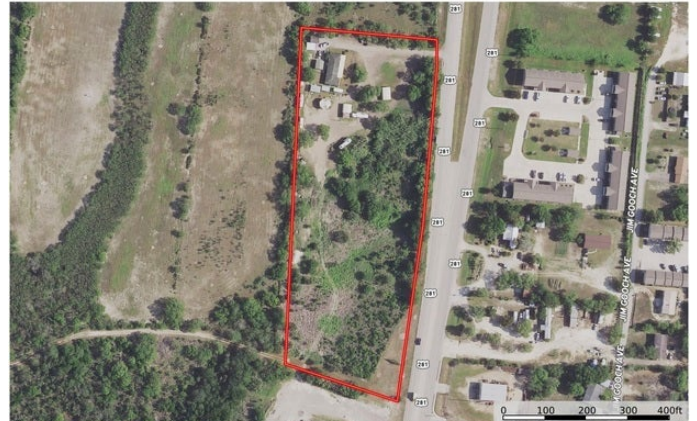
5.91 Acres 5801 Hwy 281 Three Rivers, TX Live Oak County, Texas, 5.91 AC +/-