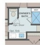
Opt. Owner's Shower Seat