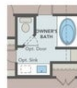
Opt. Owner's Tub/Shower