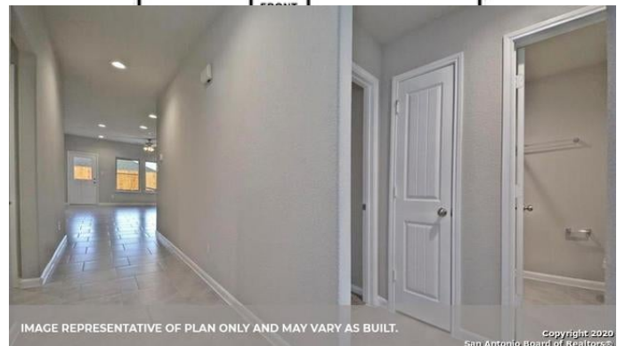
IMAGE REPRESENTATIVE OF PLAN ONLY AND MAY VARY AS BUILT.

Copyright 2020 San Antonio Board of Realtors®