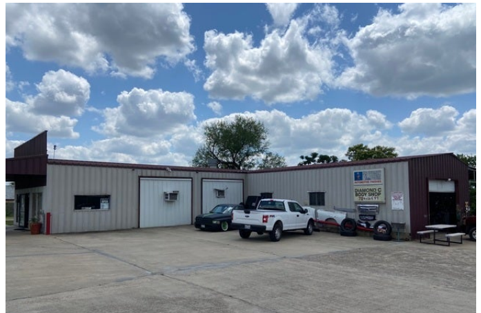
Three Rivers Body Shop Live Oak County, Texas, 0.647 AC +/-