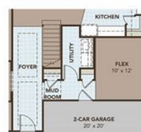
Opt. First Floor Stairs