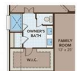
Opt. Enlarged Shower