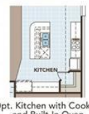
Opt. Kitchen with Cooktop and Built-In Oven