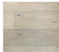
European Oak Hardwood Floor