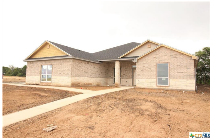
B.A. EMMONS CONSTRUCTION