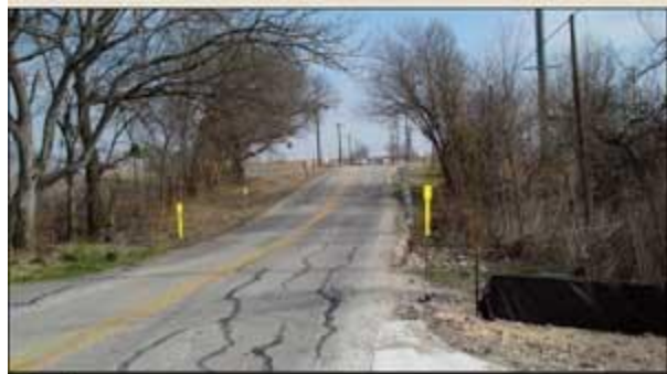
D Low-water crossing just east of FM 685