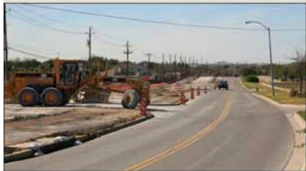
B Widening of the current Victoria Station Blvd.