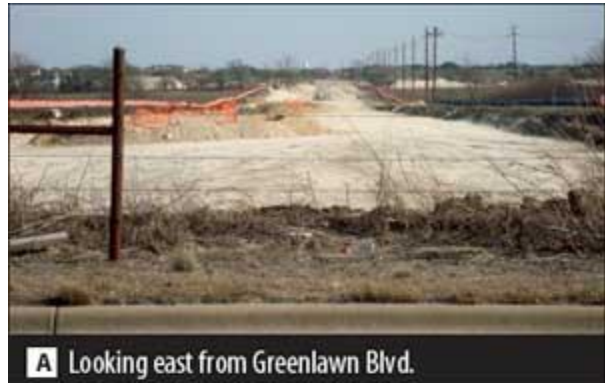
A Looking east from Greenlawn Blvd.