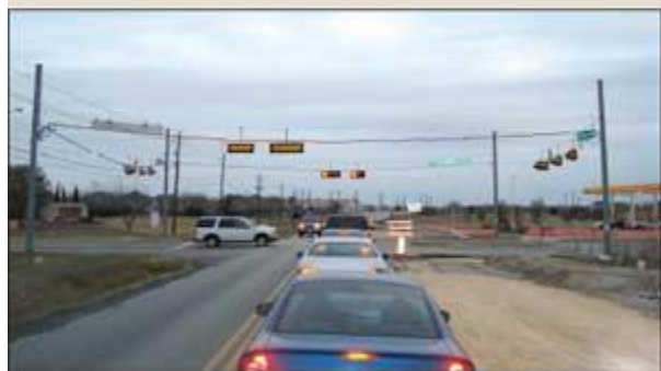
C Corner of Pflugerville Pkwy. and Heatherwilde Blvd.