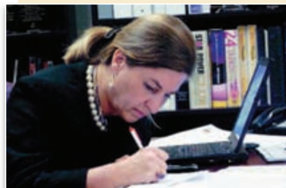
Among the desk duties she has on this day, Puckett writes up a market analysis, approves an advertisement and reviews materials for a closing.